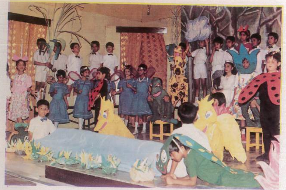
Class II A, B & C performing for the Variety Show