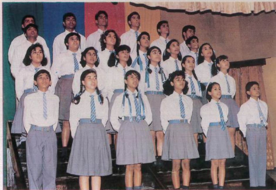
Blue House - Winner Of House Chorus Competition