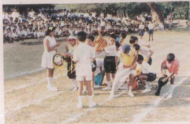
Prep House - The Clown Race