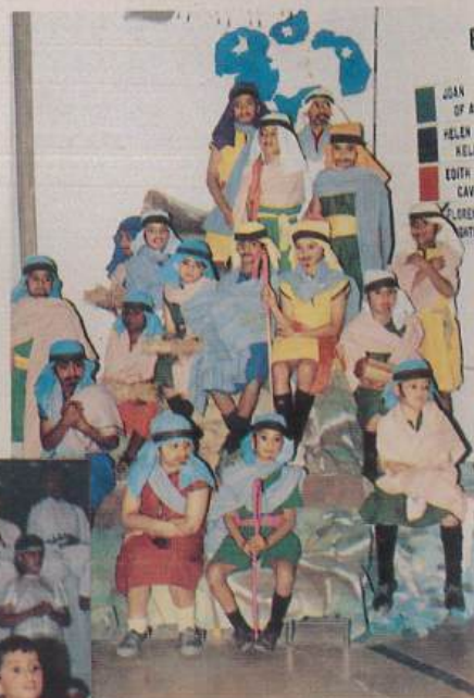
The Shepherds Keeping Watch at Night