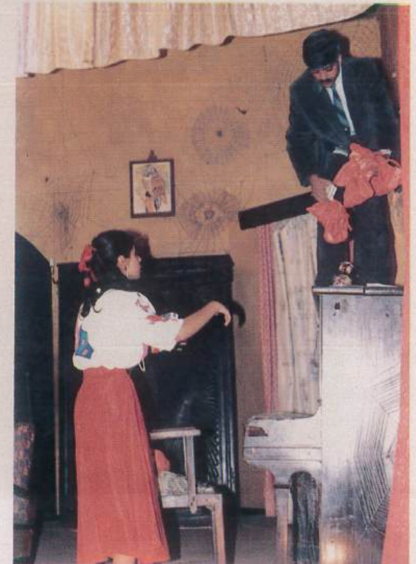
The Treasure Falls Out From Behind A Panel Above The Piano