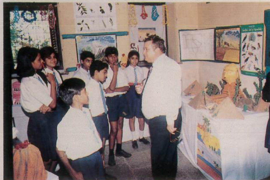
The Principal Commending The Children on Their Work