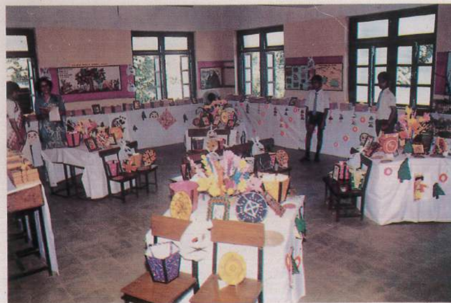
The Art And Craft Of Middle School On Display