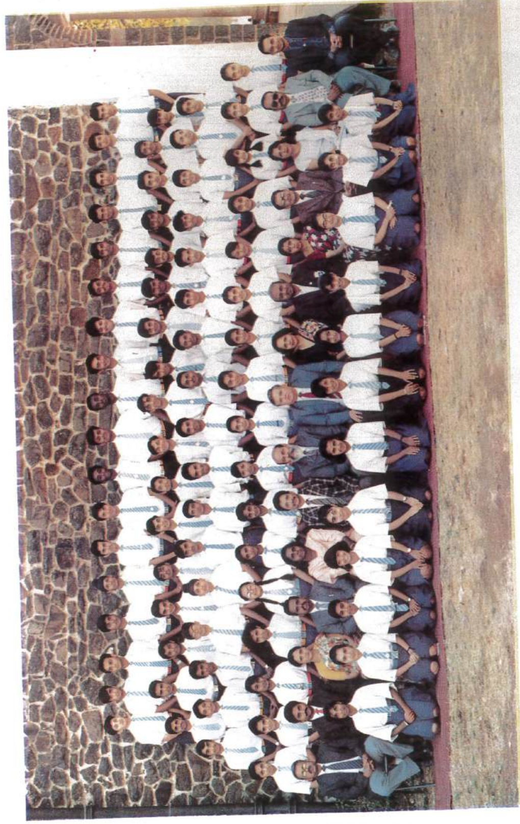
I.C.S.E. PHOTOGRAPH - 1994 - 95.