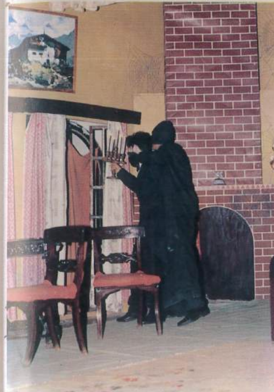
The Mysterious Hooded Figure Silencing The Butler