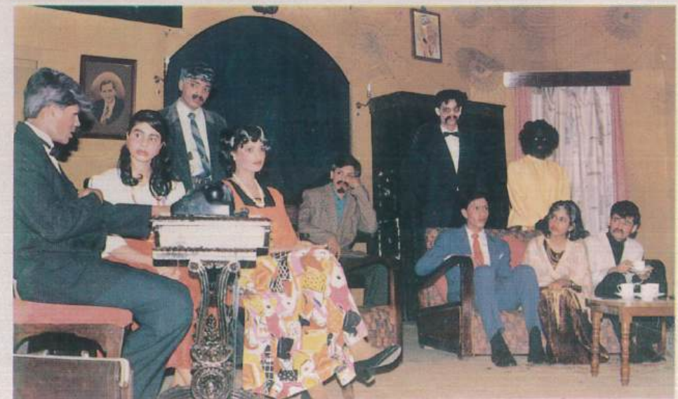
The reading of the will of Cedric Russell - (L. to R.) P. Master, Sally, Celia, Hannibal Hix (T.J. Lathrop, J. Regent, Agatha Withers, Forstman and Edgars and Zenia in the background.)