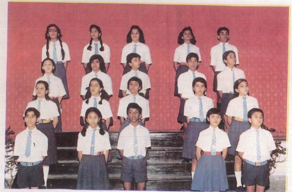
Class VIA - Winners of Junior Elocution Competition.