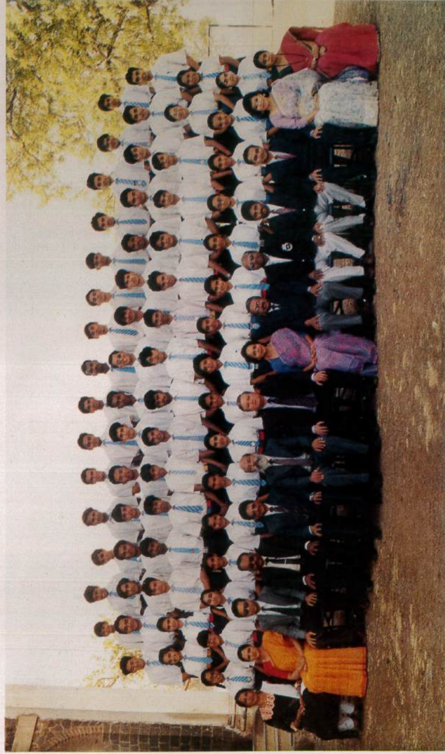
I.C.S.E. PHOTOGRAPH - 1996 - 97