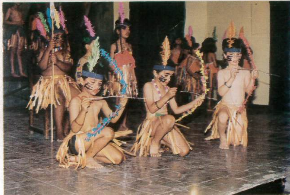
PREP A AND B ONE LITTLE, TWO LITTLE, THREE LITTLE, LITTLE INDIANS