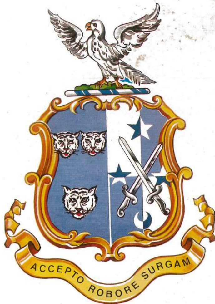
THE BOMBAY EDUCATION SOCIETY

Barnes High School, Deolali and Christ Church High School, Byculla.