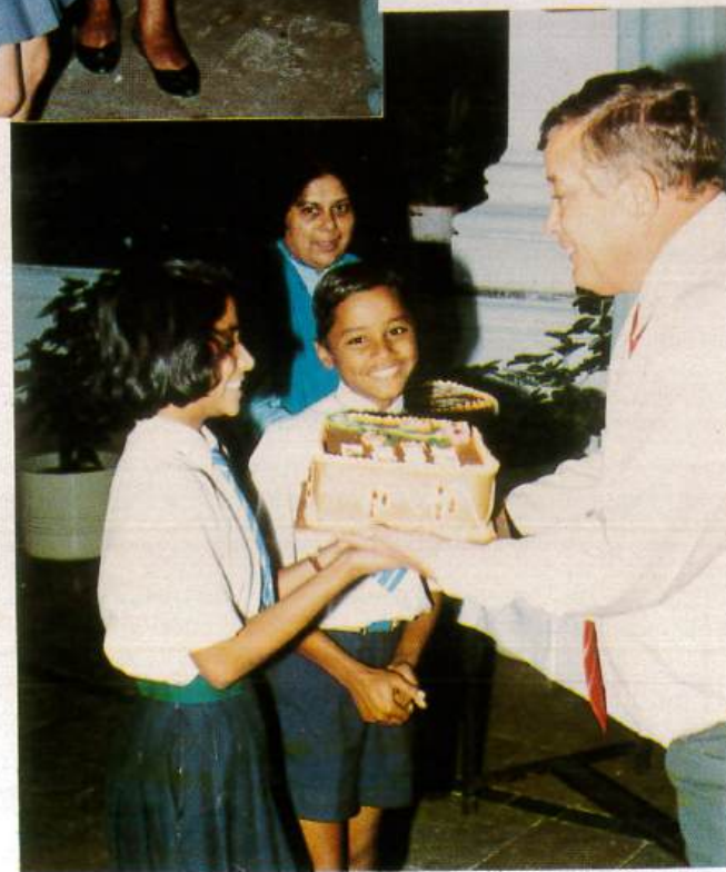
STD III B WINNING CLASS OF GROUP II THEY RECITED "A MODERN GRANNY"