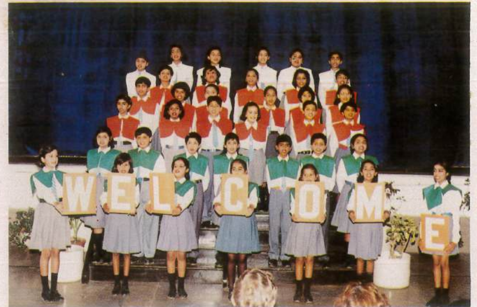
A WELCOME SONG BY STD VI