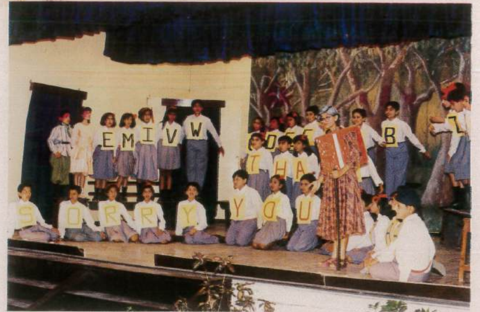
" THE ALPHABET'S HOLIDAY " A PLAY BY STD V