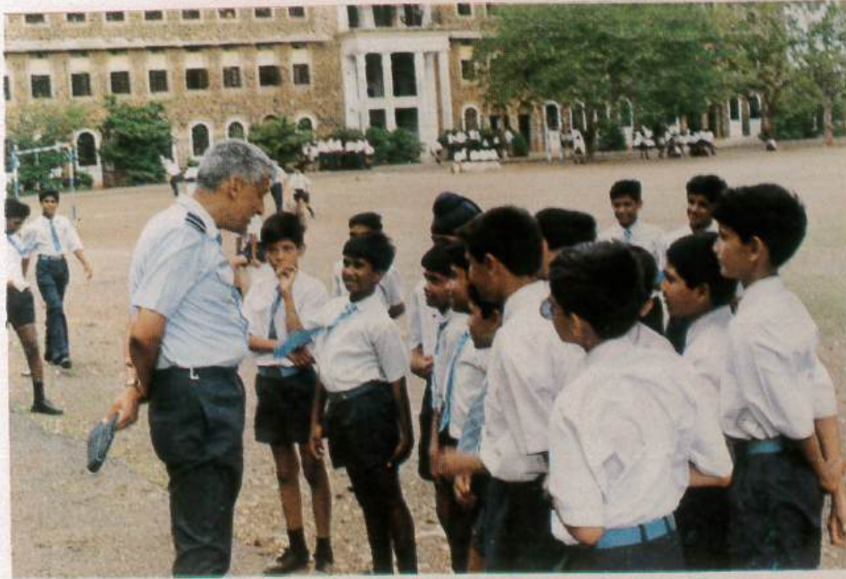
THE AIR MARSHAL EXCHANGING PLEASANTRIES WITH THE LLOYD BLOCK BOYS. THE LLOYD BLOCK CAN BE SEEN IN THE BACKGROUND