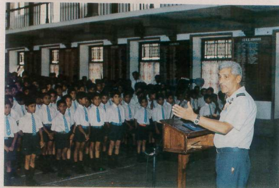
THE AIR MARSHAL ADDRESSING THE STUDENTS IN EVANS HALL