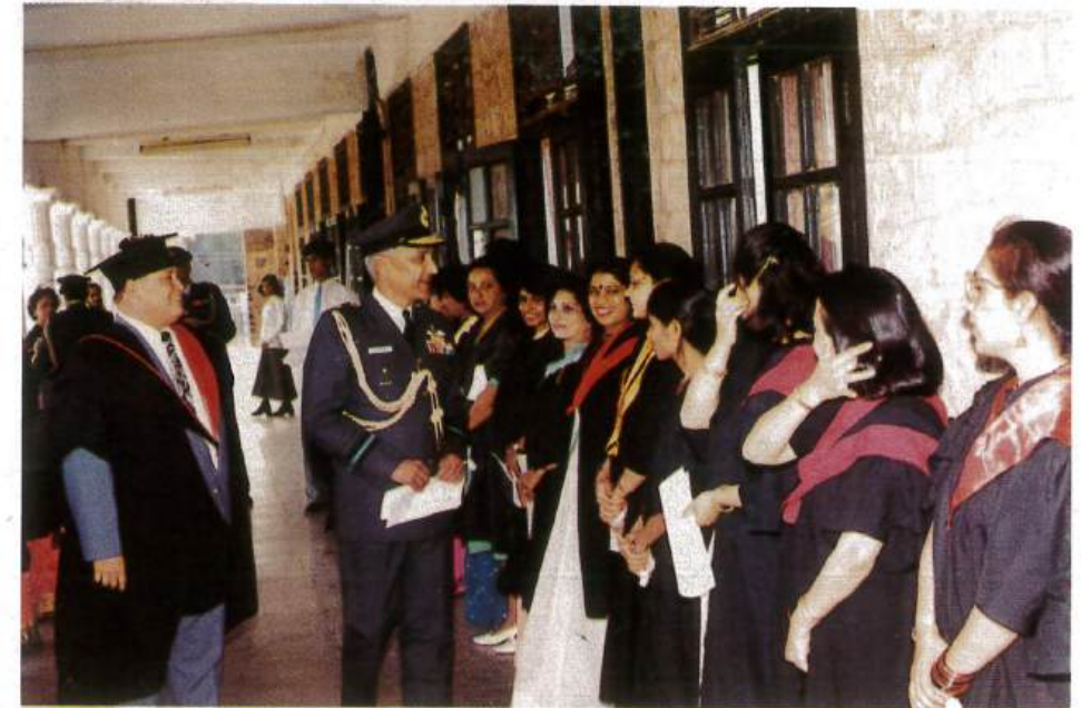
AIR MARSHAL TIPNIS BEING INTRODUCED TO THE LADY STAFF MEMBERS ON PRIZE DAY

Grant that I may be faithful gardener. Help me to point the tender plants to Thee, the light of Life and Lord of all that is. And let there be fruit from our garden. Help me to teach as Jesus taught. Amen.