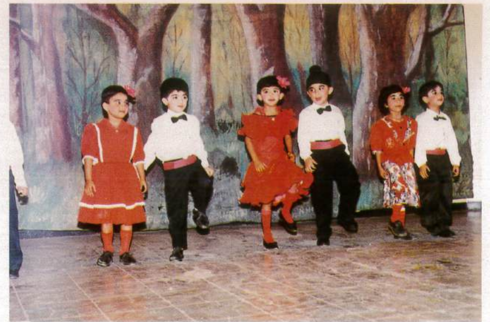
THE NURSERY CLASS IN SONG DANCE