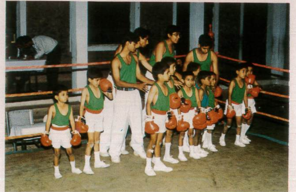
CANDY WINNERS OF THE MULLINGS EVENT