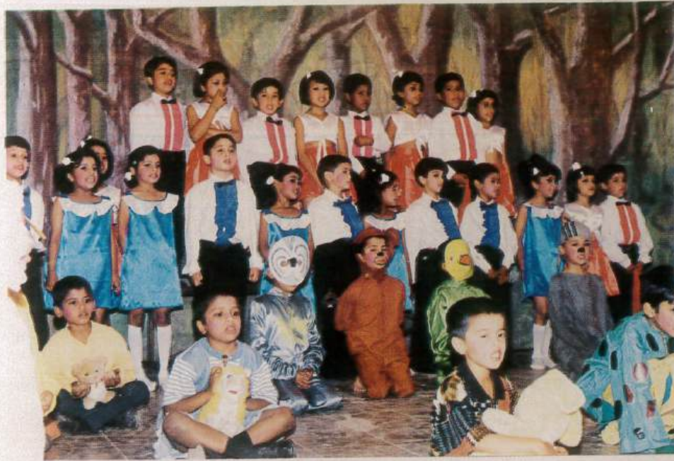
STD I SINGING "GOD MADE ALL THE ANIMALS"