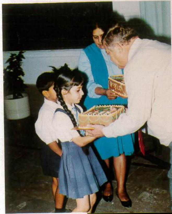
STD II A WINNING CLASS OF GROUP I THEY RECITED "BETTY AT THE PARTY"