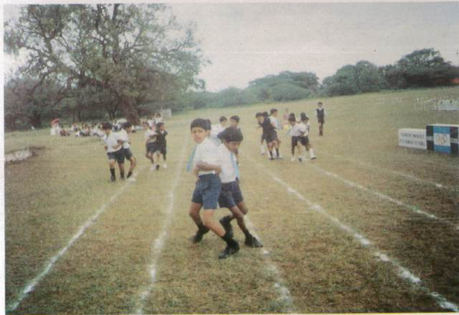
TUGGING EACH OTHER TO VICTORY ! THE JUNIORS ON THEIR SPORTS DAY